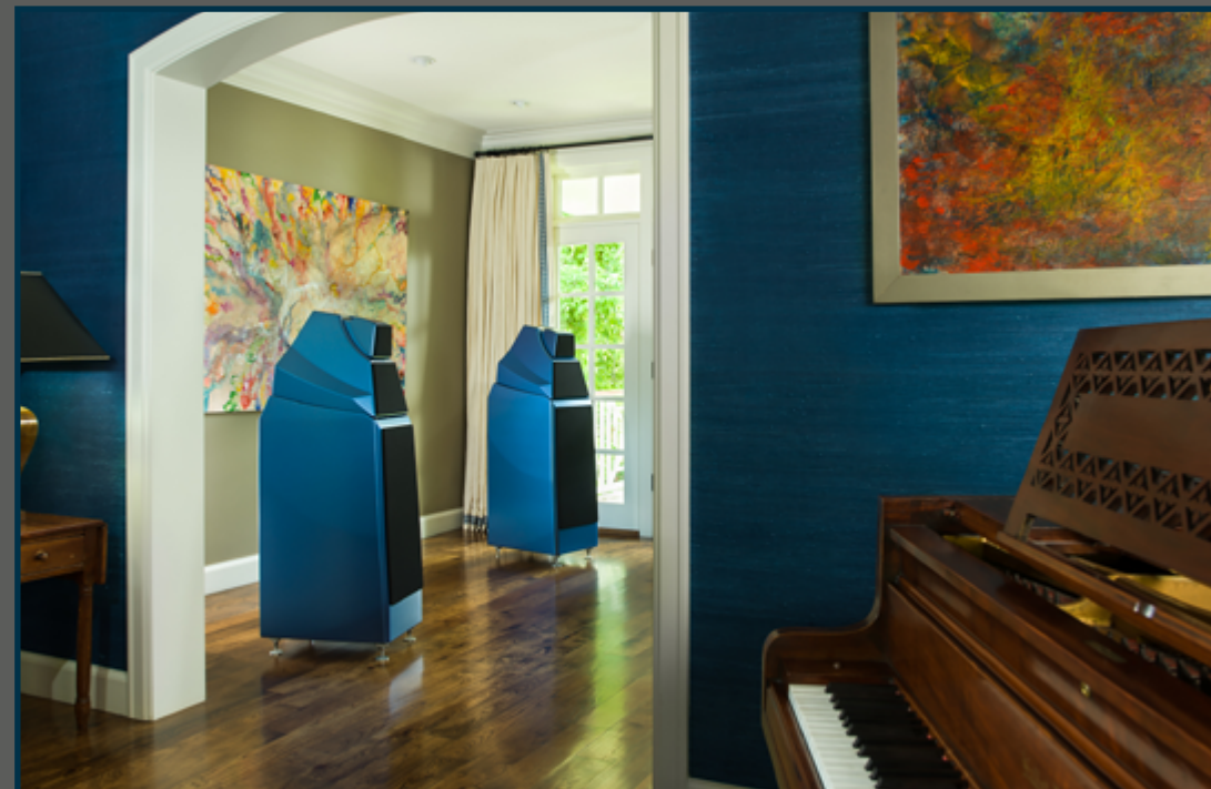
The Alexia Series 2 in Cobalt Blue Satin

satin or clear coat. Finally, our craftsmen polish the painted surface, observing a standard unique to Wilson Audio. The resulting painted surface is unrivaled—even by the world's greatest automobile manufacturers. All of this takes place in Wilson's in-house, state-of-the-art paint facility by some of the most experienced and talented paint experts in any industry.