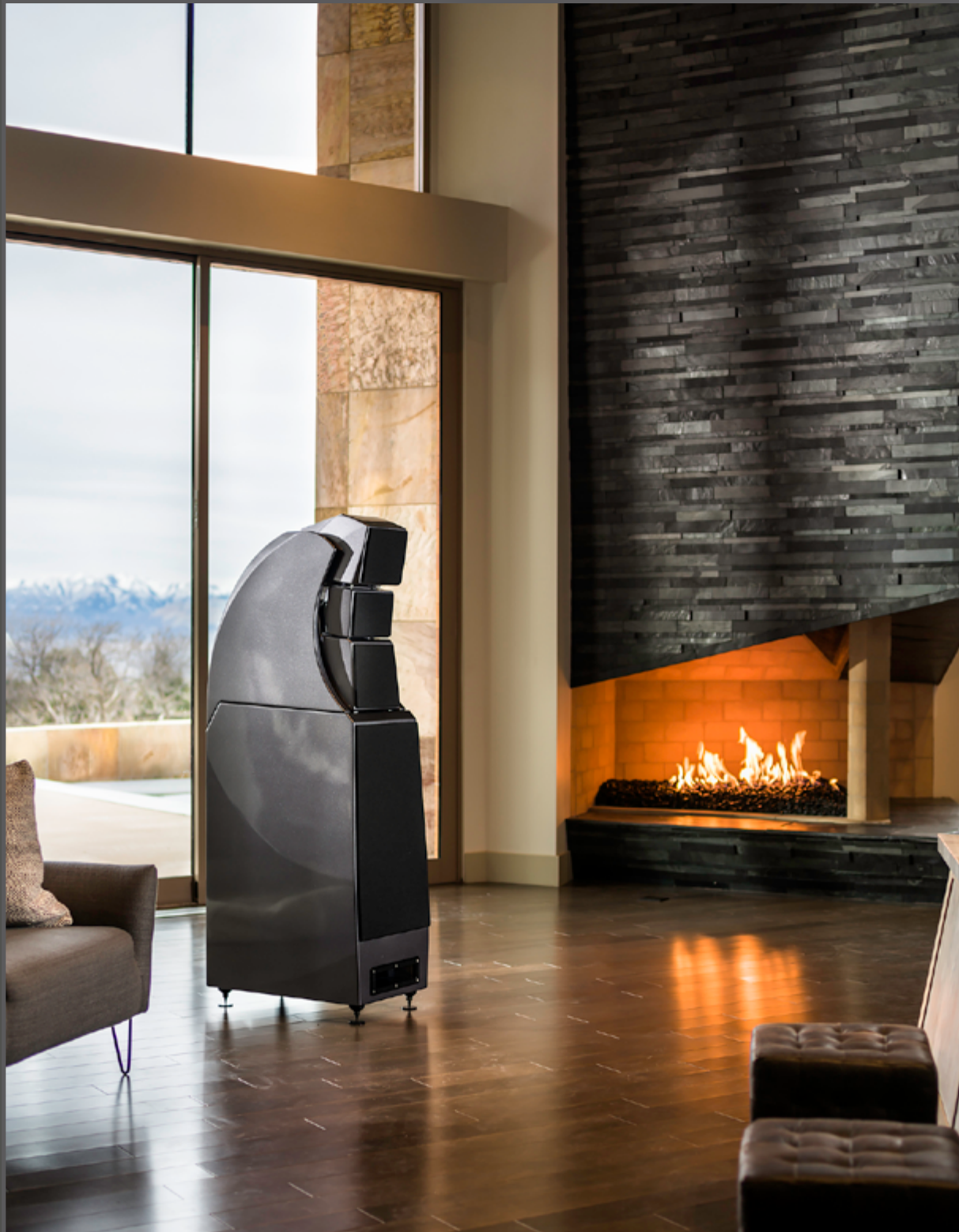
The Alexx in Galaxy Grey