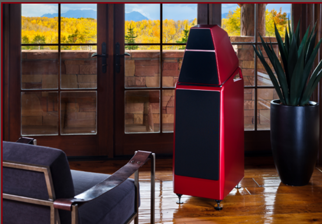
The Sasha DAW in Crimson Satin

WilsonGloss is a multi-stage process. It starts with a proprietary protective gel coat layer. After the craftsmen meticulously sand and polish the surface to a tolerance of 1/4000 of an inch, several layers of base and metallic colors are then applied. All of which is then followed by several applications of