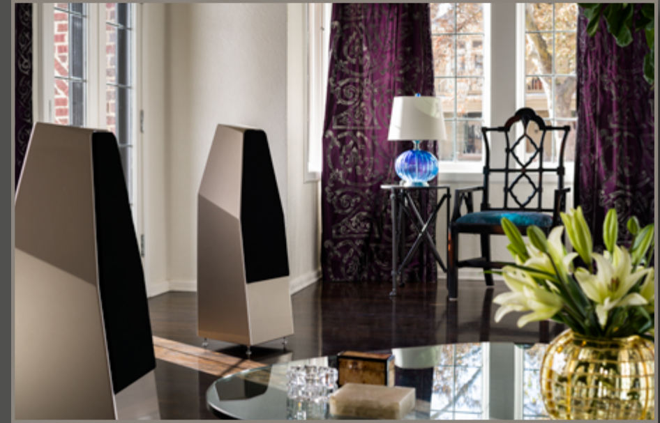
The Sabrina in Quartz