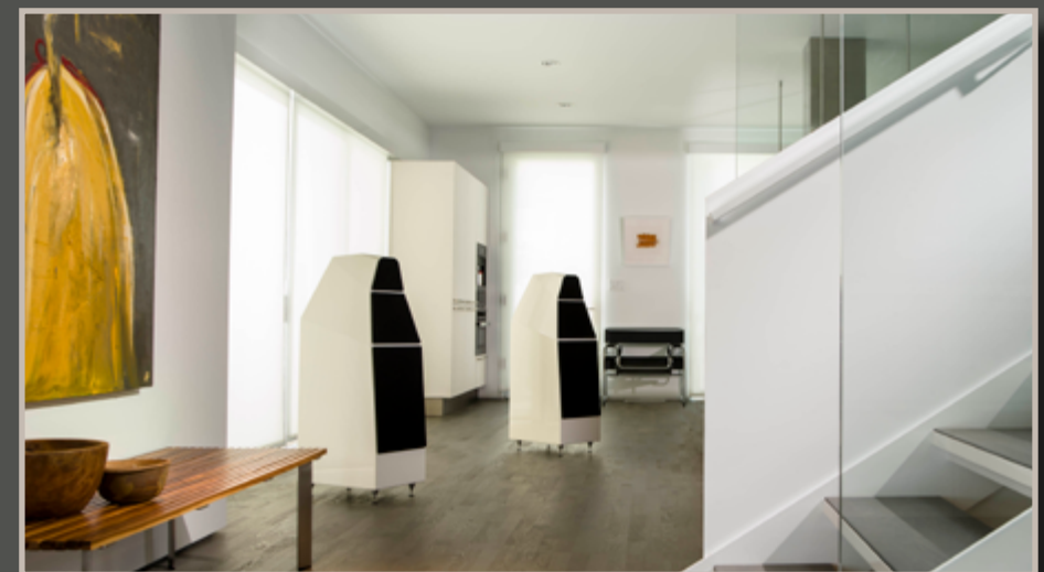
The Yvette in Ivory

Sabrina and TuneTot are available in three standard Wilsongloss® colors—Quartz, Galaxy Grey, and GT Silver. Three upgrade colors—Ivory, Crimson Satin, and Diamond Black—are also available for an additional charge. The customer has a choice of two hardware colors—which are available in black or clear anodized aluminum.