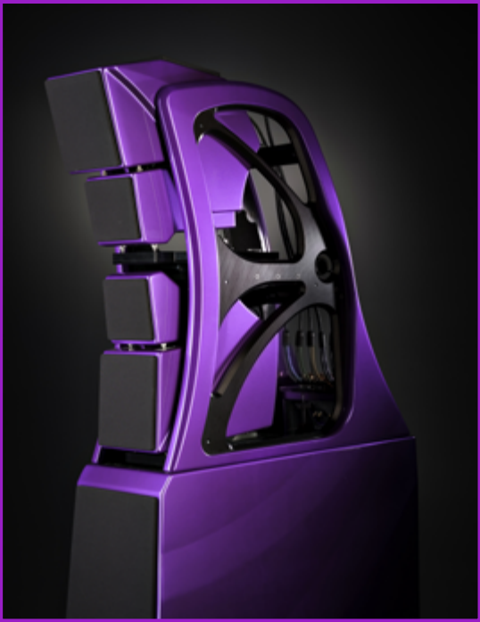
Chronosonic XVX Viola Pearl fully appreciated. The additional layers combined with the pearl finish provide a sense of depth and subtly nuanced color unsurpassed by any other process.

As the name suggests, Premium Pearl features a different look and feel when compared with standard metallic finishes. Unlike metallic paints, where the flakes are visible within the paint surface, the metal forming pearl’s grain structure is much finer, giving the surface pearlescent depth. Pearl finishes are exceedingly challenging to paint as any flaws in the surface are immediately apparent and visible. However, Premium Pearl is much more sophisticated when compared with most automotive pearls. Wilson’s process involves multi-colored base coats; each sprayed a layer at a time. The new system takes nearly twice as long to paint and requires up to three times longer to fully cure. The resulting finish must be seen to be