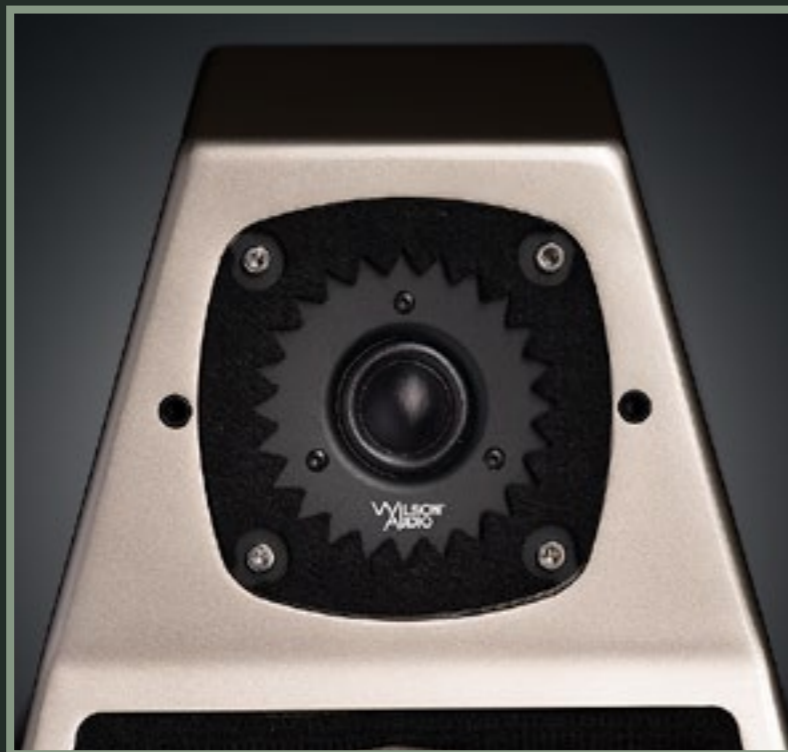
Wilson Audio Specialties