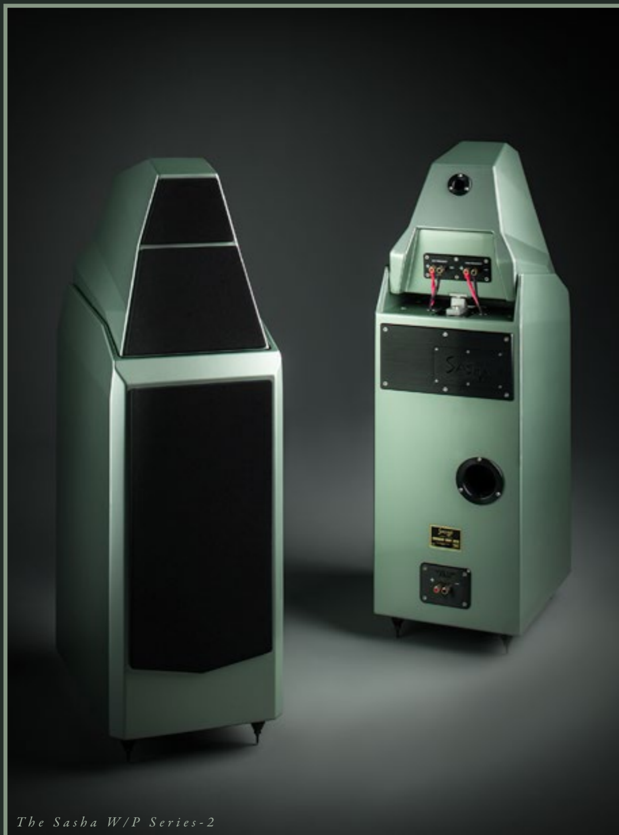
The Sasha W/P Series-2

owners a great deal of musical pleasure, but demanded relatively little in return. It did not require bi-amping—or even biwiring—eschewing unnecessary complexity for a fundamentally correct design, executed at an unparalleled Olympian standard.