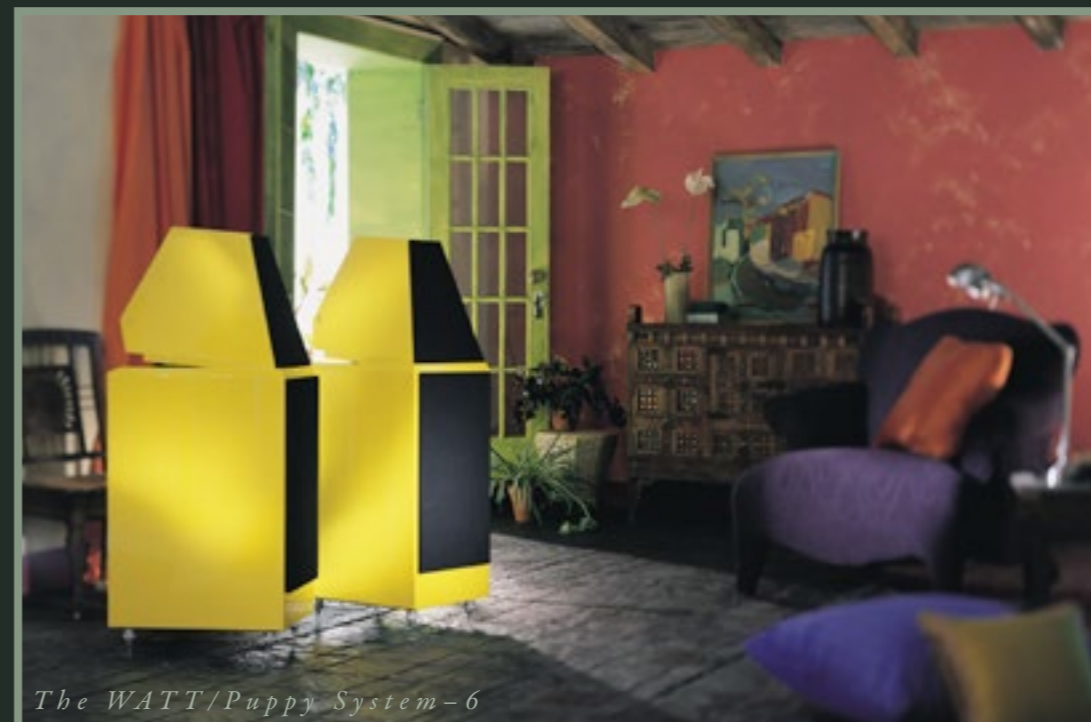
The WATT/Puppy System-6

ready had the legendary WAMM under his belt, itself an unprecedentedly ambitious and groundbreaking assault on the state of the art.