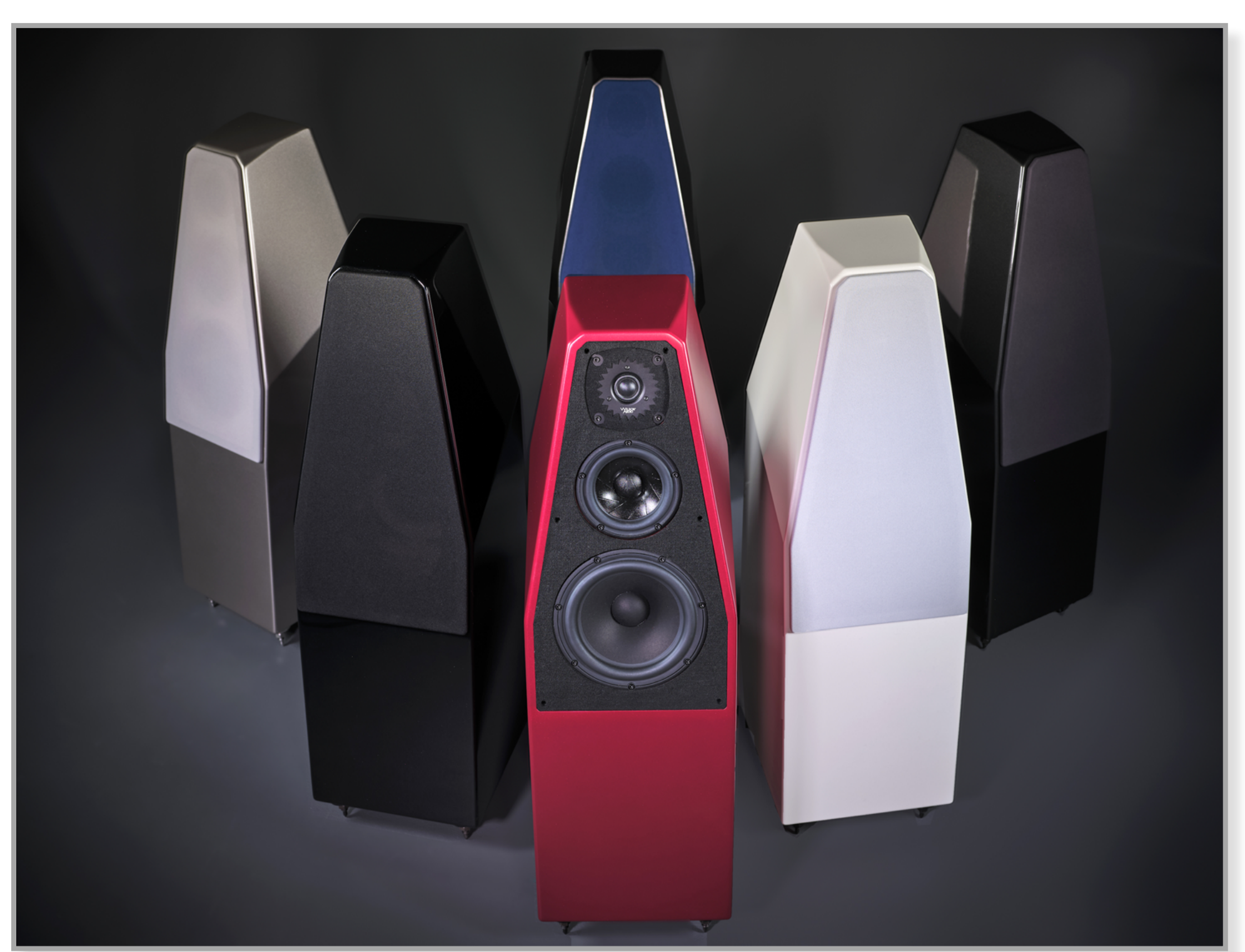
SabrinaX is available in three standard and three upgrade WilsonGloss® finishes, which can be coordinated with five grille colors. Metal work is available in either clear or black anodize.

Enclosure Type: Rear Ported(bass), Rear Vented (midrange)