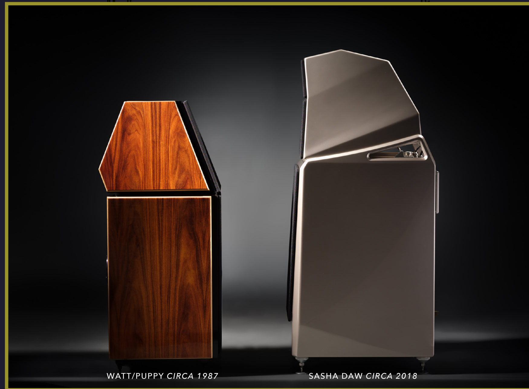
WATT/PUPPY CIRCA 1987