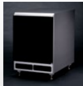
The WATCH Dog